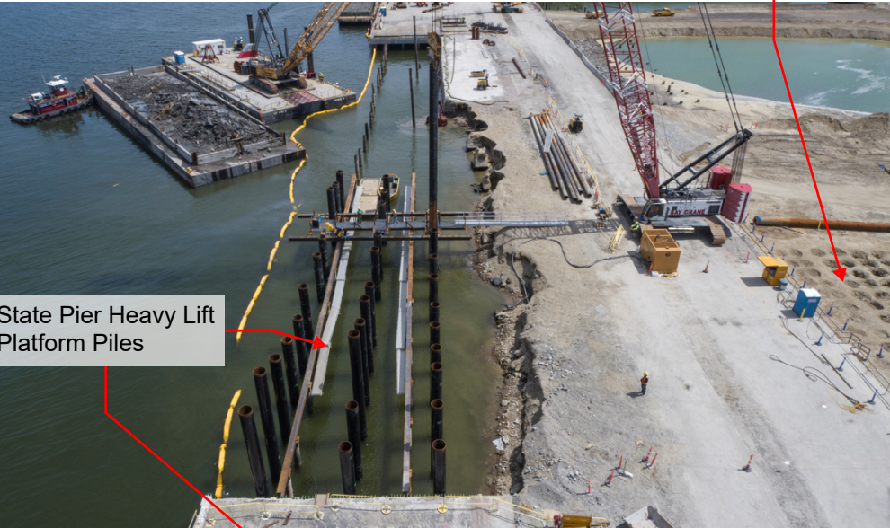
State Pier Heavy Lift Platform Piles